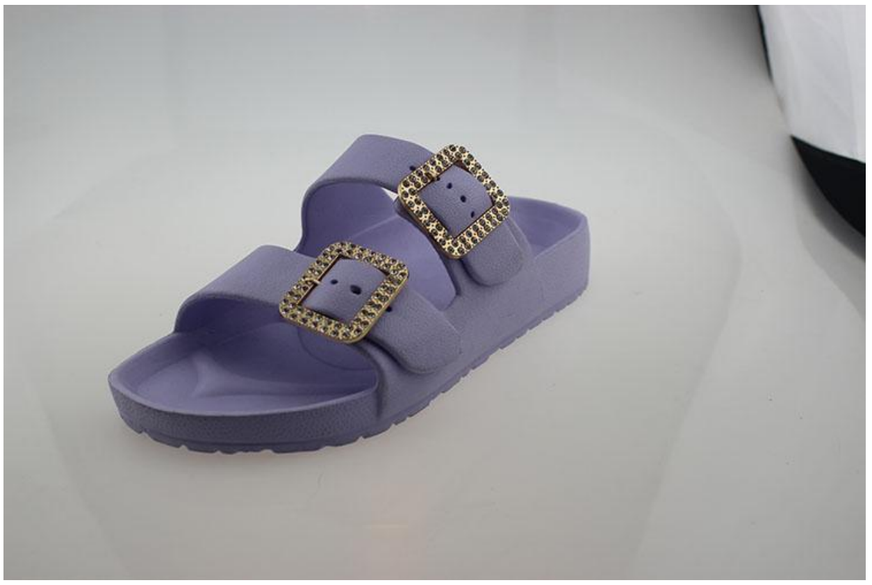
Vedio of Women's Eva Slide Slippers