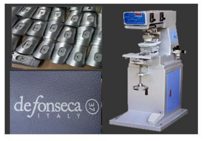
Pad Printing Machine