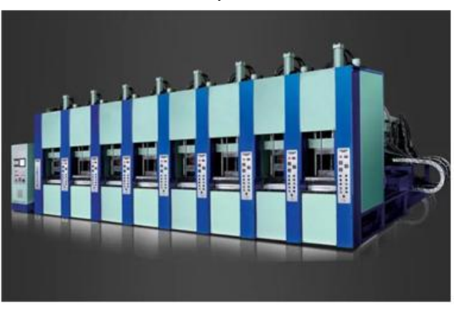
EVA injection machine