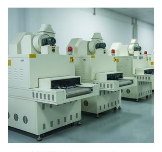
UV light machine