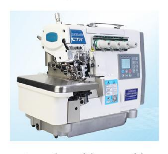
automatic welting machine