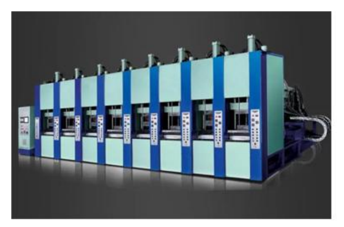
EVA injection machine