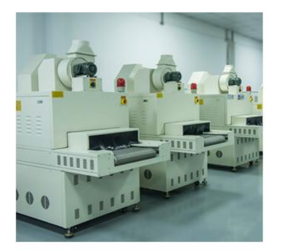
UV light machine