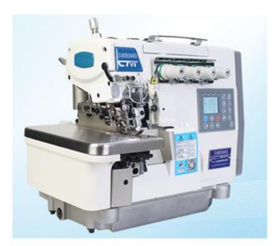
automatic welting machine