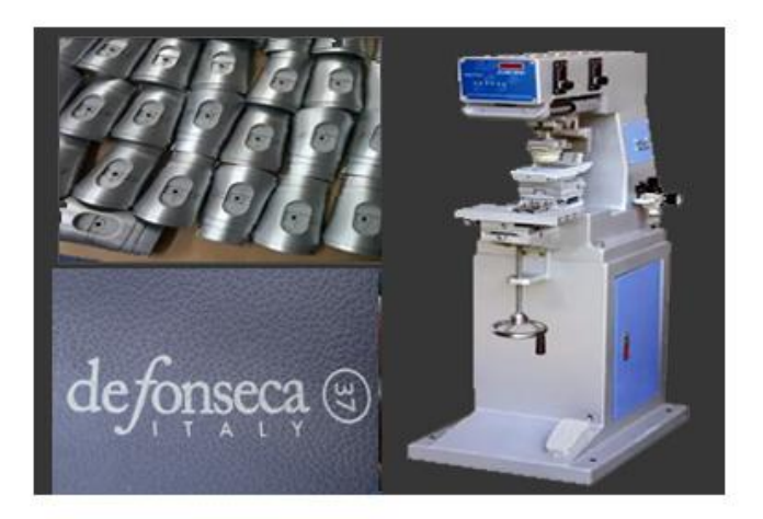
Pad Printing Machine